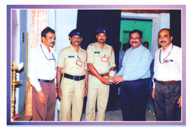
Fire Safety Wing of BDL Bhanur was awarded World Safety Day Shield on 28 Apr 2012 on the eve of World Safety Day 2012.

Safety, Health and Environment are well maintained at BDL. The two corporate committees i.e. Industrial Safety Committee which is statutory and Explosive Safety Committee are functioning to cater to the needs of the Company. Safety Committee Meetings are held at regular intervals for monitoring safety, health and environment as per statutory requisites. The works are carried out in compliance with The Factories Act, 1948 and strictly adhere to STEC (Storage and Transport of Explosive Committee) regulations for explosives safety. Regular medical check up is conducted for employees working in hazardous zones by qualified Medical Officers. Approvals have been obtained for Akash Process Buildings and Magazines from CFEES, New Delhi and construction is under progress. Management Approval has been obtained for location of Missile Test Bed (MTB) at Ibrahimpatanam Unit. Training programmes are organized by HRD through National Safety Council, Mumbai, Central Labour Institute, Mumbai, Regional Labour Institute, Chennai and Centre for Fire, Explosive and Environment Safety, Ministry of Defence, New Delhi to inculcate safety consciousness and to establish safe working environment in the premises. Safety Week / Month is celebrated during the month of March