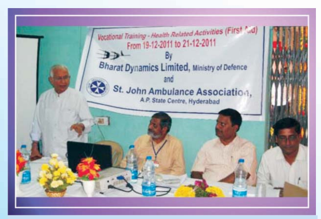
Vocational Training on Health Related Activities (First Aid) was organized during 19 - 21 Dec 2011 in association with St. John Ambulance Association at Hyderabad.

31.4 The Company again in association with